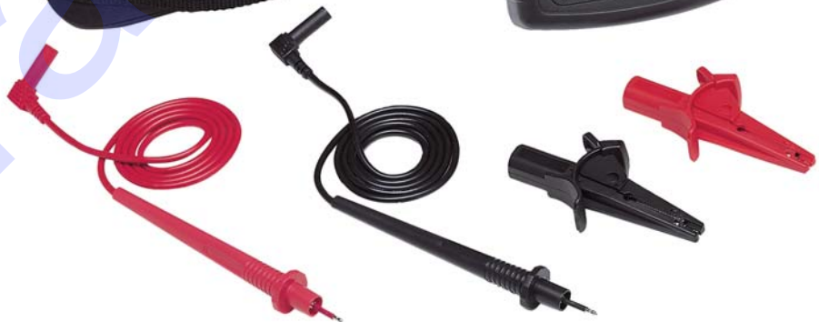
Soft carrying case and test leads included